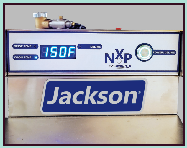
Digital Temperature Display

The NXP-HTD is a basic, high temperature sanitizing dishmachine that comes with a great price point, so it's easy to step-up from a low temp to a high temp machine! We call it basic, but it's far from that! It is loaded with features like Sani-Sure™ final rinse system, delime cycle, vent fan control, hi-limit thermostat and low water protection, and more! It's super simple to operate, and provides first-rate results!