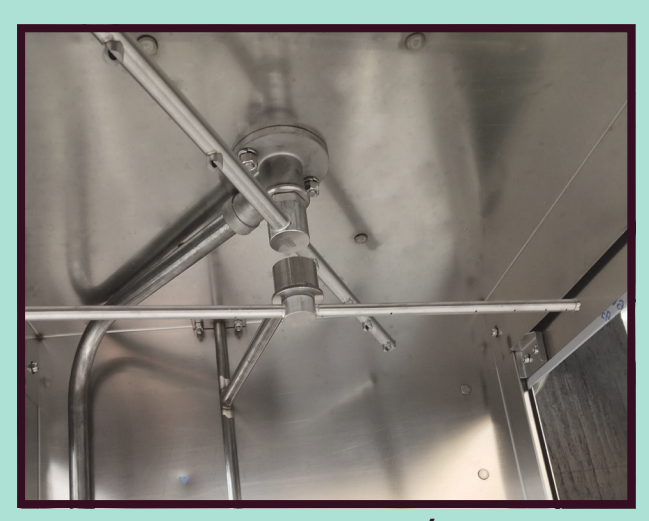
Interchangeable Wash/Rinse Arms