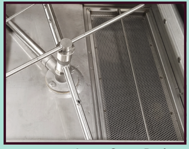
Large Scrap Baskets